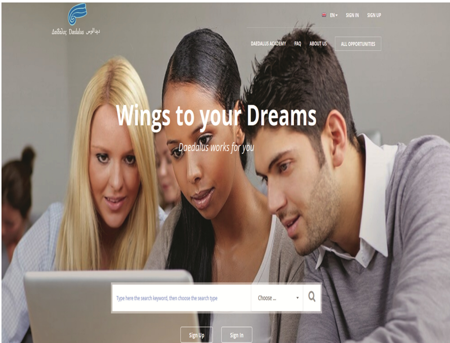
Fig. 1. Daedalus’ Home Page ( http://daedalusportal.eu/home )