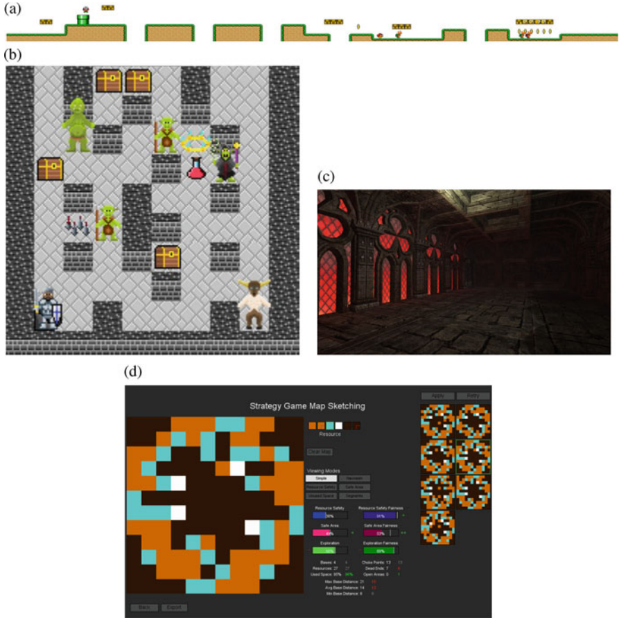
Fig. 9.2 The example level generators discussed in this chapter. Super Mario Bros is a trademark of Nintendo; all images used with permission. (a) A Super Mario Bros level that maximizes the frustration of a particular player [16]. (b) Mini Dungeons : a screenshot from a generated level. (c) Sonancia : a screenshot from a generated level. (d) The Sentient Sketchbook strategy map design tool

the dungeon are monsters, treasures and potions. Monsters sometimes block the path to the exit and need to be overcome to win the level, other times they block paths to treasures or just stand around in the open. Fighting monsters drains health, which can be regained by consuming potions. Importantly, the game can be played in many different ways, depending on whether the player focuses on finishing levels quickly, getting all the treasures, killing all the monsters etc., and also depending on how risk-averse the player is.