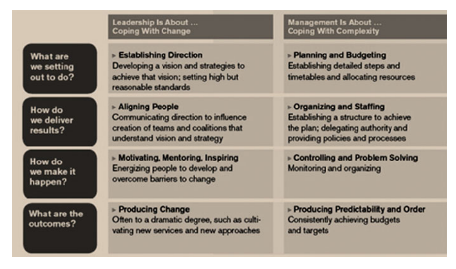
Fig. 1 Difference between leadership and management (Source: According to Kotter 2001)

ability to get people to act beyond assigned and defined roles to achieve a common goal. Leadership is activated, not by the title given (e.g., "manager"), but by the ability to move people beyond "problem situations".