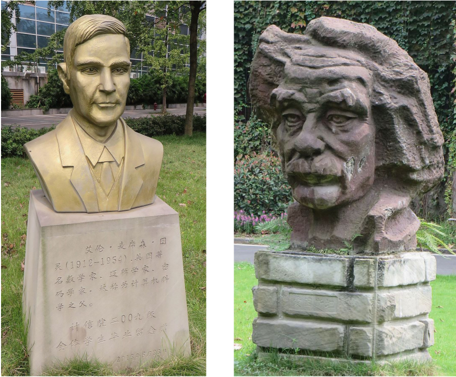
Fig. 1. Busts of Alan Turing and Albert Einstein on the campus of Southwest University, Chongqing, China.

through the theoretical computing device that has become known as a Turing Machine [42]. This is an abstract model of a computing machine that is useful for demonstrating what is and what is not computable. This astoundingly novel approach has had a profound effect on the theory of computation subsequently, effectively founding the field of theoretical computer science.