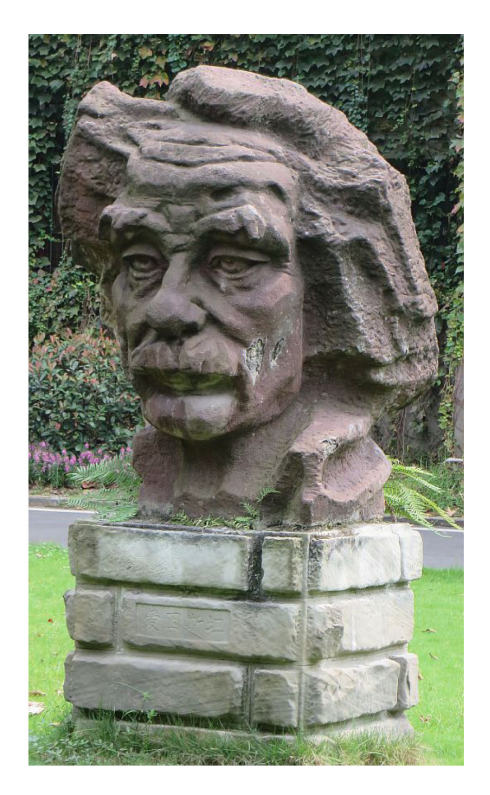
Fig. 1. Busts of Alan Turing and Albert Einstein on the campus of Southwest University, Chongqing, China.

through the theoretical computing device that has become known as a Turing Machine [42]. This is an abstract model of a computing machine that is useful for demonstrating what is and what is not computable. This astoundingly novel approach has had a profound effect on the theory of computation subsequently, effectively founding the field of theoretical computer science.