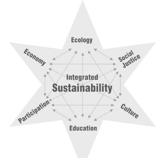
Fig. 1 G. Becker six-pointed star of sustainable development

Economy means economic development, Ecology means environmental protection and Justice for me implies social justice (in graphics often too simply abbreviated as 'society'). In addition to these usual three dimensions, I also include 'Participation' (of groups and citizens), 'Culture' and 'Education' as other independent dimensions.