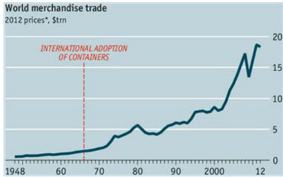
Table 2.1 Growth of shipping from 1970 to 2012