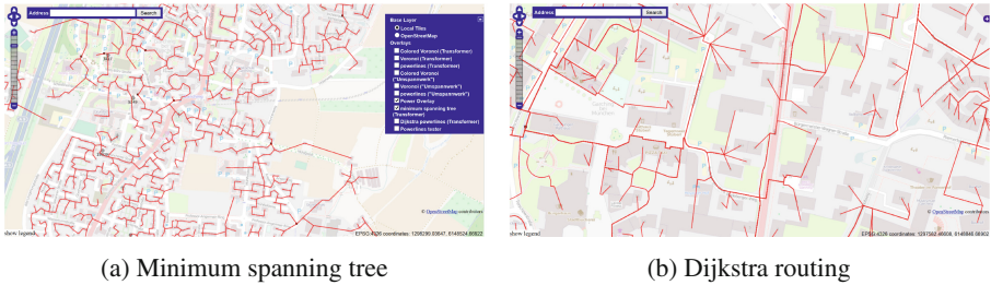
Fig. 4. Rule-based inference of power distribution network (village)