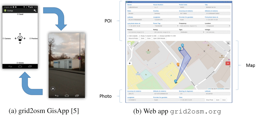
Fig. 2. Current OpenGridMap components