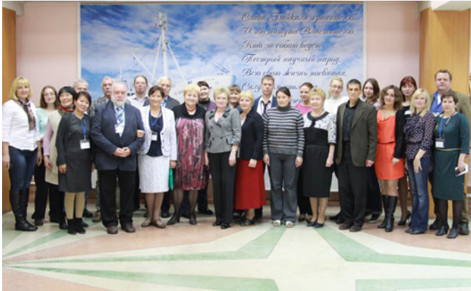
Fig. 5 International communication and cooperation is key to scientific progress in landscape research. The photograph shows participants of an international symposium about water quality monitoring, organized by the Limnological Institute Irkutsk in November 2013.

with research and education in science and agricultural science. The Siberian branches of the RAS and RAAS are responsible for landscape and agri-environmental research over Siberia. Environmental problems in Russia have grown over the past 25 years (Shaw and Oldfield 2007). Landscape scientists therefore have a lot to do to monitor and combat these problems in their landscapes.