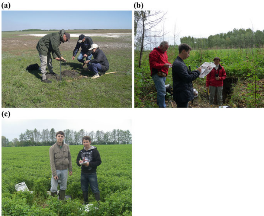
Fig. 4 Assessment of soil conditions in a Solonetz–Solonchak soil association of the Kulunda Steppe (a) and a Phaeozem–Chernozem association in the Pri–Ob Forest steppe (b). The underlying cooperation between the Institute of Soil Science and Agrochemistry (ISSA) in Novosibirsk and the Leibniz Centre for Agricultural Landscape Research in Müncheberg (Germany) was aimed at harmonizing methods for the taxonomic and functional evaluation of soils. c Young scientists measured soil and water parameters as part of this project

Soil science related to agronomy: Besides the classical work of soil mapping and studies of pedogenetic processes under different land use, the valuation of soil fertility and productivity, and testing interactions of cropping systems with soil fertility have been an important topic of experimental research work in soil science. Examples of such work include studies about the fertility, rational use and preservation of Chernozems (Abramov and Salova 1998; Eremina 2009; Khmelev and Tanasienko 2009), about acid soils (Tandelov 2012), about the migration of chemical elements between adjacent ecosystems along a geochemical catena (Titlyanova 2008) and about assessing the fertility of typical soils used for agriculture (Smolentseva et al. 2014; Fig. 4). Afonin et al. (2008) developed an interactive agricultural ecological atlas of Russia, which contains important pedologic criteria such as soil types, humus contents and rooting depths. Another important topic of soil scientific research is studies about the status and rehabilitation of technogenic soils (Ermolov et al. 2011). This is related to agronomic