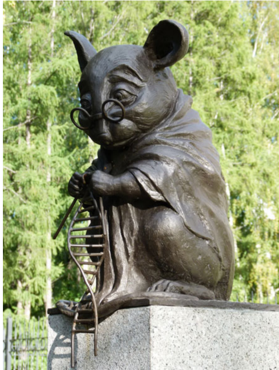
Fig. 7 Sculpture in Akademgorodok near Novosibirsk, the scientific center of Siberia and headquarter of the Siberian branch of the RAS.

the Far East. RAAS had an extended internal structure including administration departments for planning and coordination, a science organization section, an international relations department, pilot plants, a land and estate registration department, a construction and material provisions department, libraries and a printing press (UEAA 2006).