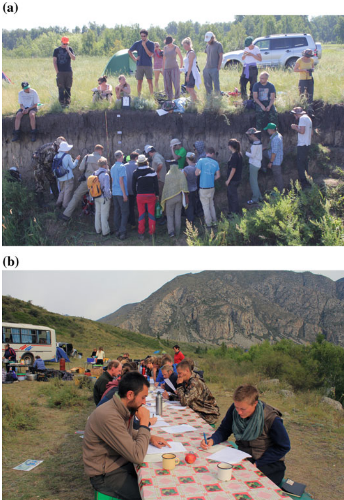
Fig. 9 Teaching soil science and soil–vegetation interactions. a The profile shows a Chernozem in the forest steppe. From their inherent properties Chernozems are the most fertile soils of the globe. b Minutes and examinations are part of the open air summer school.

across the countryside without trails or prepared adventures allow participants to feel the landscapes under their feet, to catch its colours, sounds and smells. The personal experience obtained this way empowers the participants to gain their own insight into the complexity of natural conditions in a most unforgettable way. This supports open discussions providing a better understanding of the details of both local and global consequences of human land use.