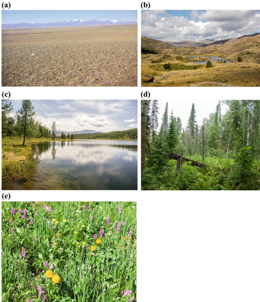
Fig. 8 Typical landscapes used by soil ecological summer schools a Mountain desert, b Mountain tundra, c Mountain forest tundra, d Southern Taiga, e Forest steppe. The floristic diversity of forest steppe grasslands in West Siberia is still very high due to extremely low human impacts. About 60 species of vascular plants per 100 m 2 have been found at some locations.

development. They try to mediate a simple access to understanding long-term needs in local productive land use taking into account global trends.