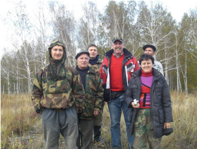
Fig. 2 Russian–German field expedition team for measuring landscape hydrological processes in West Siberia in the frame of the “Soil quality indicators” project. Participants came from the Institute of Soil Science and Agrochemistry (ISSA) Novosibirsk and from the Leibniz Centre of Agricultural Landscape Research Müncheberg (ZALF) in Germany