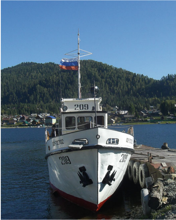
Fig. 6 Research vessel of the Institute for Water and Environmental Problems (IWEP) in Barnaul. It is located on Lake Telozkoye in the Altai Mountains to monitor water quality and sediment

WHO and WMO. RAS researchers are in demand as top scientific experts by the industry and the business community. RAS has full membership relations with about 50 international non-governmental organizations (IAP 2013). Akademgorodok at Novosibirsk is the scientific centre of Siberia (Fig. 7).