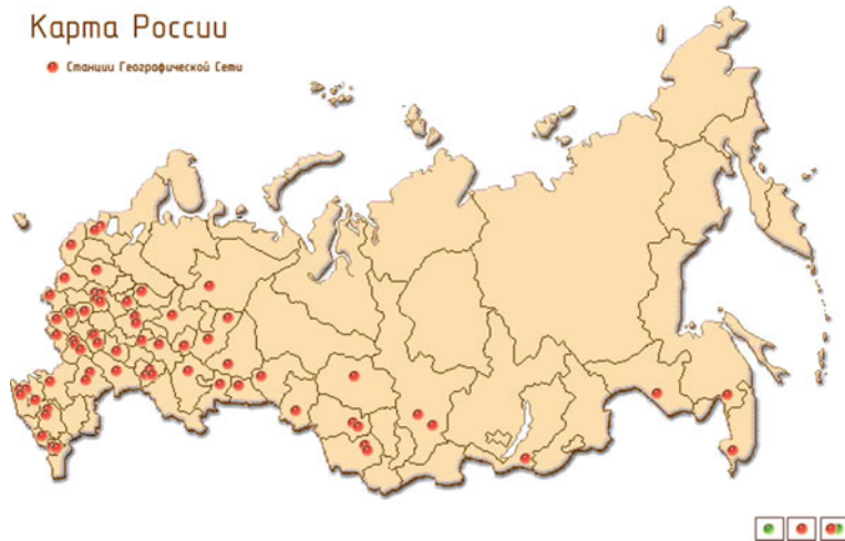
Fig. 3 Monitoring stations coordinated by the Geo-Network Department of the Pryanishnikov All-Russian Institute of Agrochemistry (VNIIA) in Moscow. Only a few stations are located in Asian Russia

Modelling agro-ecosystems and agroclimatic potentials: Some progress has been achieved in this emerging topic. Concepts and initial results of modelling agroclimatic potentials were developed by Kirsta (2006) and Tchebakova et al. (2011). Dronin and Kirilenko (2011) developed climate change and food stress scenarios by including socio-economic criteria in models.