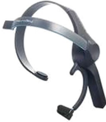
Fig. 2. The simple electroencephalograph MindWave Mobile used for collecting brain wave data. The picture was downloaded from http://mindwavemobile.neurosky.com/ in May 2015.