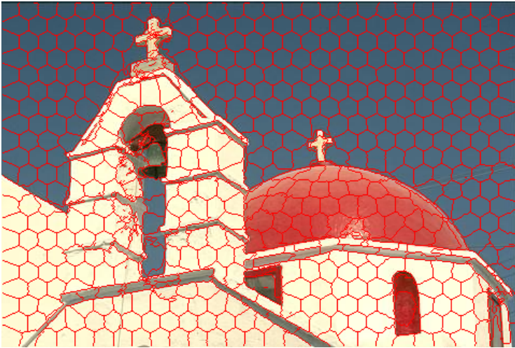
Fig. 1. An image divided into approximately 600 superpixels

A recent trend in segmentation, is to start the computation from superpixels instead of single pixels [16]. As shown in Fig. 1, superpixels are perceptually meaningful atomic regions which aim to replace rigid pixel grid. Examples of algorithms used to generate these kind of small regions are Turbopixel [9] and the widely used and very fast SLIC algorithm [1]. Over-segmenting an image using one of said techniques, and the performing actual region segmentation, can be interesting both in term of reducing the complexity of the problem (i.e. starting from superpixels instead of single pixels) and improving the quality of the final result, thanks to the intrinsic properties of superpixels [10].