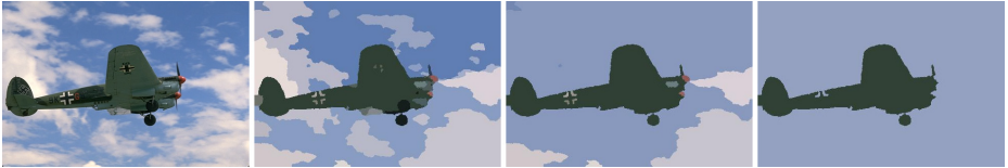
Fig. 2. A sample image and hierarchy of 3 segmentations obtained with k = 50, 15, 2 and \delta_C metric.

When k = 2 , the algorithm stops and returns the full dendrogram D = \{L^m, \dots, L^2\} that can be cut at will to obtain the desired number of regions. An example of different cuts of the dendrogram can be seen in Fig. 2 .