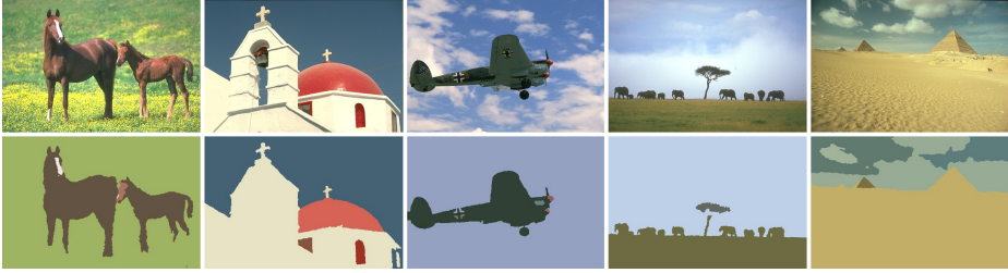
Fig. 4. Sample images from BSDS500 (top) and their best corresponding segmentation outputs (bottom) using \delta_C metric.