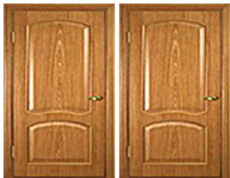
Fig. 1 A crucial task: if you open one door you are safe or dead

There is evidence that our neuro- and psychophysiological systems can react differently before the perception of two classes of events presented randomly,