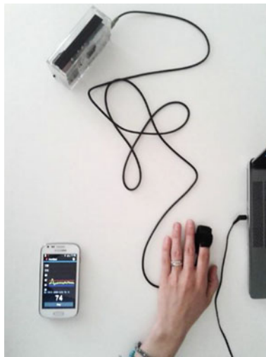
Fig. 4 Image of the CardioAlert prototype. On top left , the heart rate recorder that receives the changes in the hemoglobin detected by a led sensor connected to an individual’s finger. This signal is filtered, amplified and elaborated to obtain the heart rate by using an Arduino microcontroller. On bottom left , is the smartphone which receives the data from the microcontroller by a bluetooth connection

It may be possible to exploit these correlations between events separately in time for practical applications? For example is it possible to detect the neuro-psychophysiological reactions measured at time-1, to avoid negative events