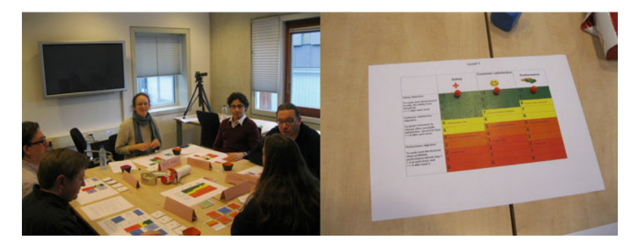
Fig. 5 Disruption mitigation game