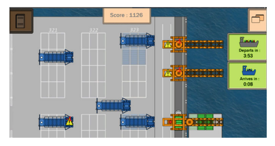
Fig. 3 Yard-crane-scheduler game (part of the screen)

Players have to make sure that ships are unloaded and loaded in time, and equipment keeps busy. Ships that cannot be (un)loaded in time result in negative points, ships that have been fully handled and depart early in bonus points. Equipment that is idle also costs points. The player has to be aware of a number of different plans or decisions that have to be aligned to each other: the unloading schedule, the loading schedule, the quay crane allocation, and the stacking crane locations.