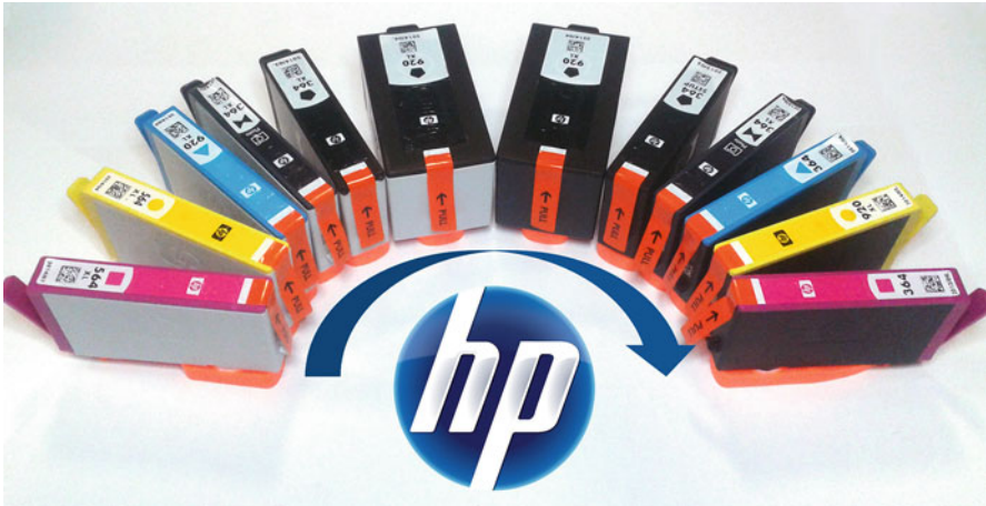
Fig. 17.2 Design changes to high volume ink cartridges to allow for increased recycled plastic content (Hewlett Packard 2015)