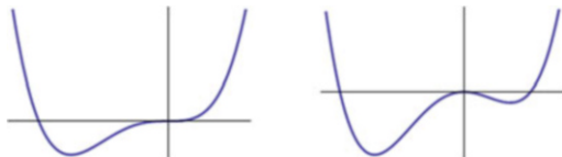
Fig. 3 Qualitative graphs of the functions g (left) and h (right).

(iii) We study first the case where f = 0 and we name J_0 the unforced functional, that is,