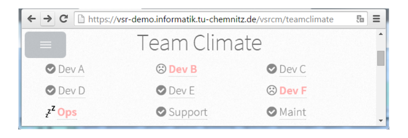
Fig. 2. Critical cases highlighting using TCAS in VSRCM

thresholds for the state model dimensions and states considered relevant for filtering. The state model allows for easy extension: additional (e.g. domain-specific) analyzers can be added and incorporated as dimensions.