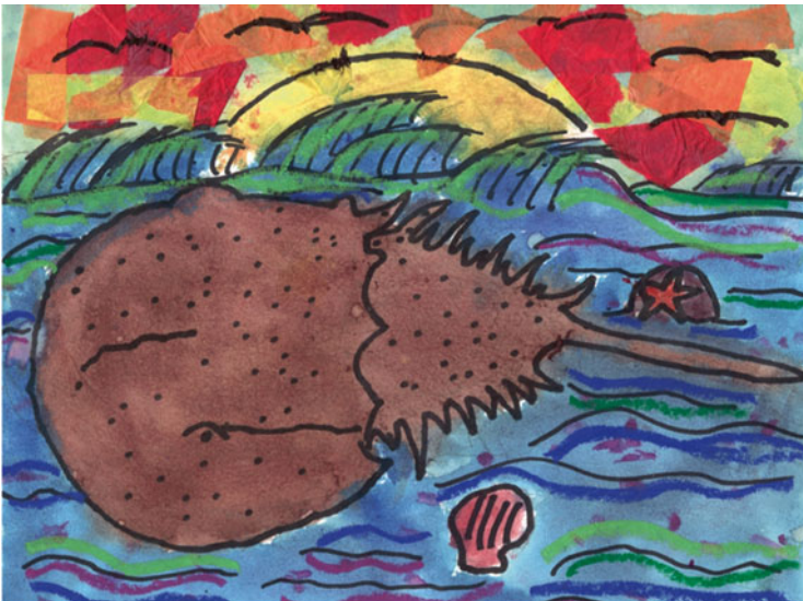
Carlos Bonilla 2005, 5th grade, Spruance Elementary School, Philadelphia, PA, USA, medium: collage