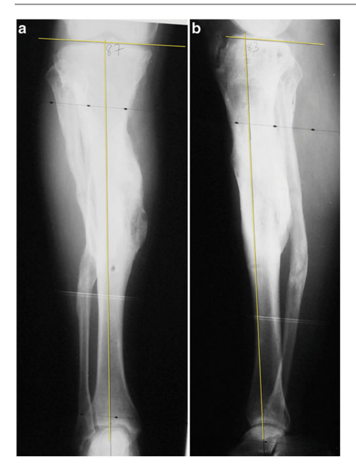
Fig. 8 Final (a) AP and (b) lateral radiograph at 2.5-year follow-up. Medial proximal tibial angle measured 87^{\circ} and proximal posterior tibial angle measured 83^{\circ}