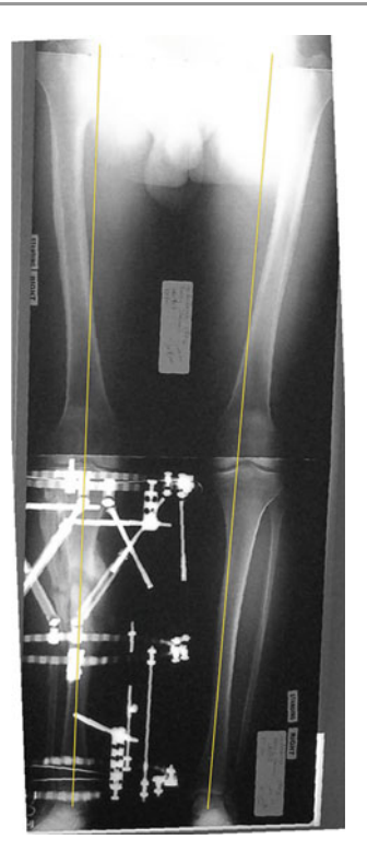
Fig. 5 Post-operative 51" erect leg radiograph after TSF frame adjustments completed. Note mechanical axis deviation of 0 mm. Leg lengths were equalized

however, it lacks stability and the deformity causes shear forces at the nonunion. Therefore, restoring stability and correcting the deformity (without auto- or allograft material) are all that is required. Deformity correction at the nonunion site coverts the shear forces into axial compression forces. It is critical that the surgeon appreciates the difference between hypertrophic and oligotrophic nonunions as the treatment algorithm of the latter requires an open approach, debridement, and bone grafting. Intra-operative support of a stiff nonunion is demonstrated with less than 5° of sagittal or coronal motion at the nonunion site without the influence of hardware or the fibula. Assuming bone viability exists, the increased vascularity obtained during distraction of the deformity can be exploited for curing infection as well.