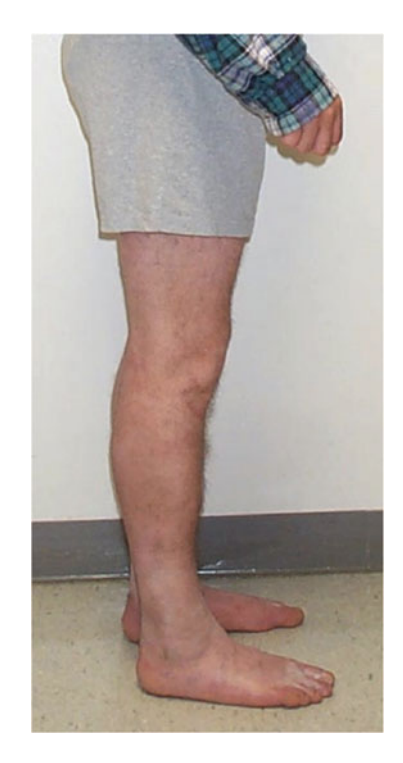
Fig. 10 Final clinical photograph of the patient from the side