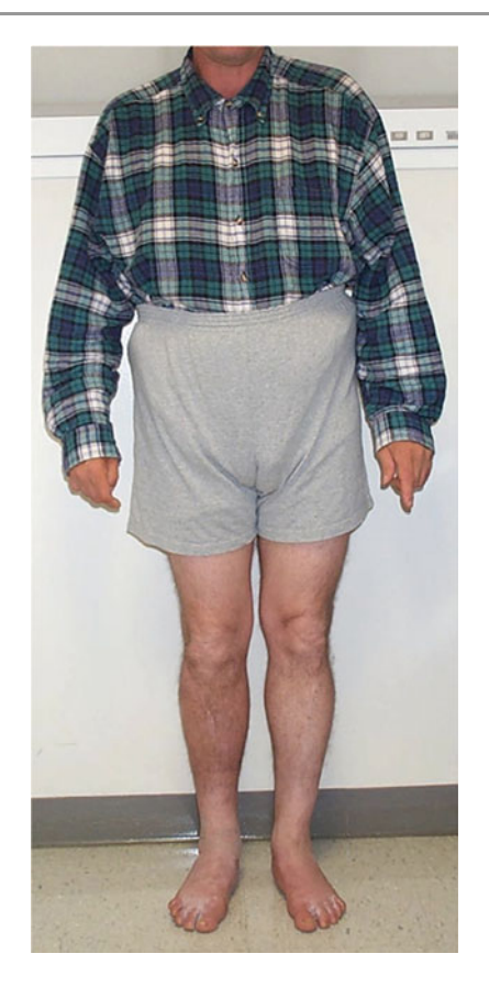
Fig. 9 Clinical photograph at final follow-up. Note the complete correction of tibia vara and limb length discrepancy. Patient was ambulating without any assistant devices