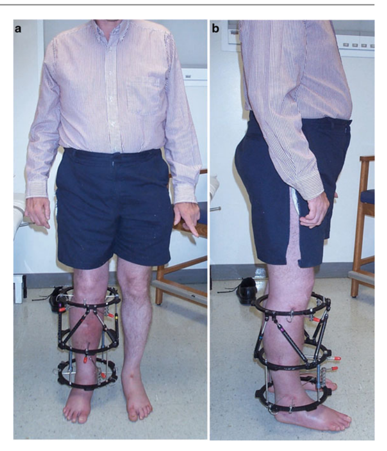
Fig. 7 Clinical photograph of the patient from the front (a) and side (b). The deformity has been corrected and the patient was allowed full weight bearing during treatment. The frame's purpose at this time was to provide stability of the nonunion, modulating the osteogenic tissue into bone