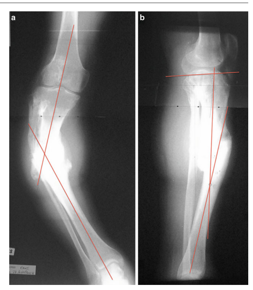
Fig. 3 Pre-operative (a) AP and (b) lateral tibial X-rays. Magnitudes of deformity were 40^{\circ} of varus, 11^{\circ} of procurvatum, and 14 mm of anterior translation. The apex of deformity was distal to the nonunion on the lateral X-ray since there was an associated anterior translation deformity