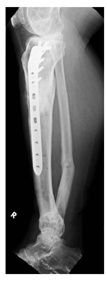
Fig. 12 Final lateral X-ray corresponding to Fig. 11

value ratio (PVR), dual-energy X-ray absorptiometry (DEXA), ultrasonography, and quantitative computer tomography (QCT) have been described.