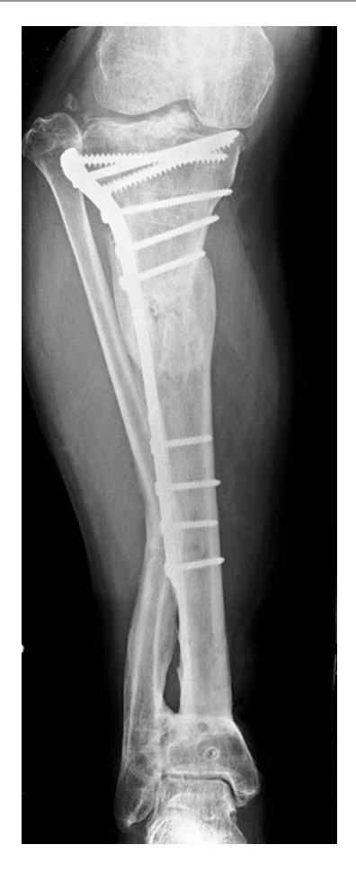
Fig. 11 Final a.p. tibial X-ray showing sound union at the plated proximal distraction area 30 months after surgery