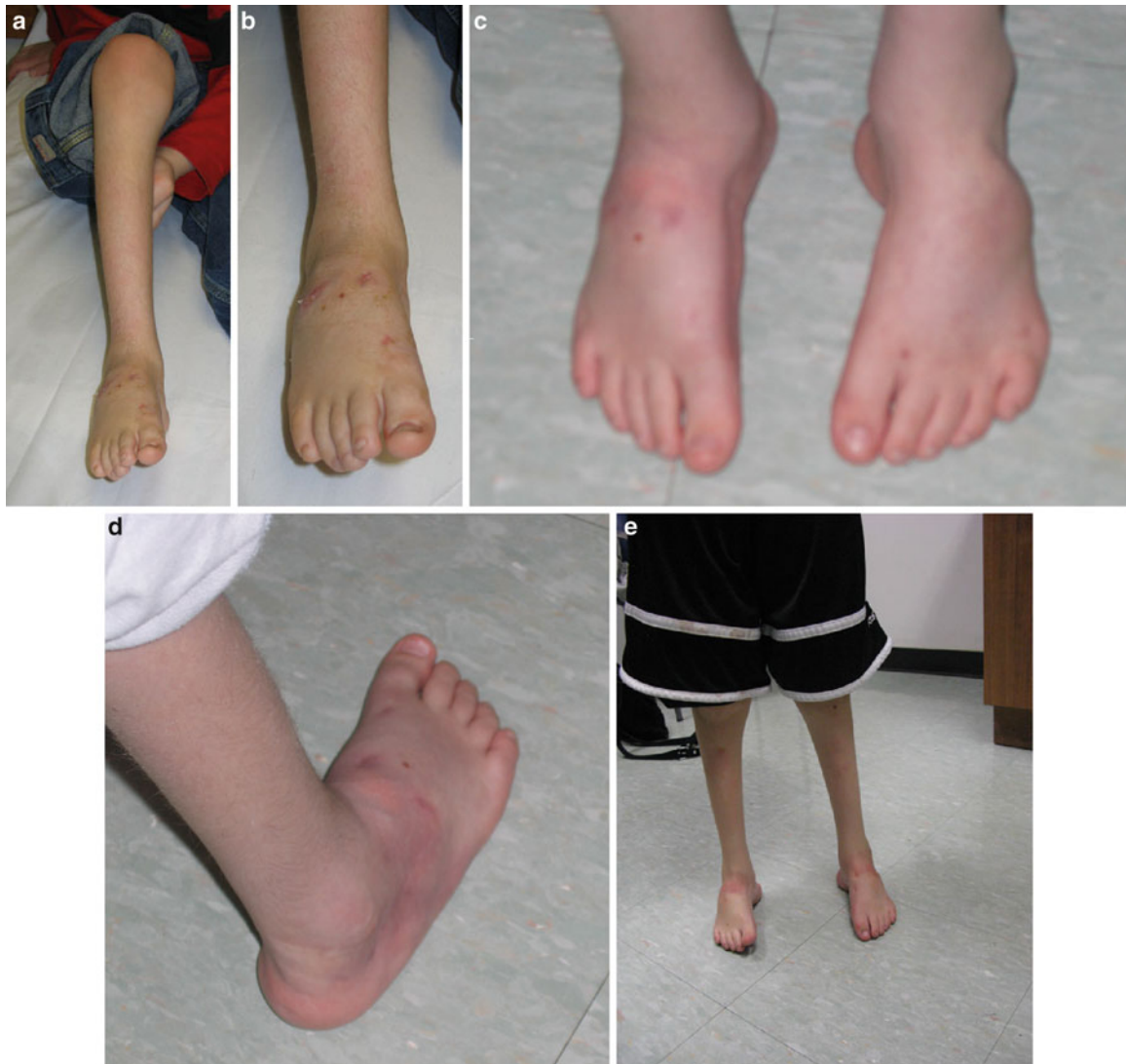
Fig. 6 (a–e) Photographs of the right foot with final correction

Patients need to be followed up closely during the correction to avoid malalignment. Weekly X-rays are obtained until the deformities are corrected, usually in 2–3 weeks. Monthly X-rays are obtained from then on until consolidation is observed on radiographs, at which time the device can then be removed. As with all fixators, it can affect radiographic evaluation by directly obscuring the osteotomy site, which may lead to errors in measurements (Sabharwal et al. 2008). One must take account for these errors; oblique