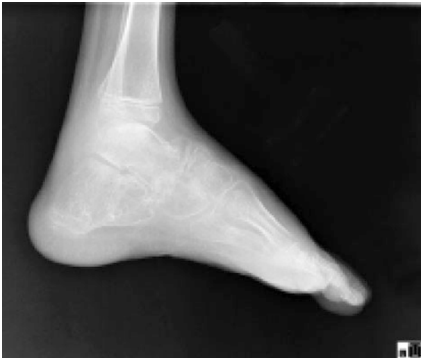
Fig. 5 Lateral radiograph of the right foot

Take AP and lateral X-rays, and correct one direction at a time at 1^\circ per day (or 1/4 mm four times per day).