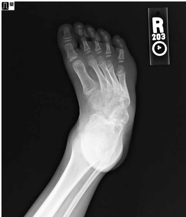
Fig. 2 Pre-operative dorsal-plantar radiograph demonstrating CAVE deformity