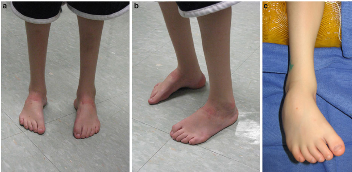
Fig. 1 (a–c) Pre-operative photograph demonstrating severe clubfoot in spite of previous corrective efforts

other an osteotomy of the calcaneus to correct the midfoot varus.