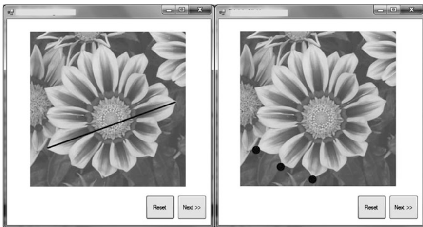
Fig. 3 Screenshots of examples from draw-based secret (left) and click-based secret (right)