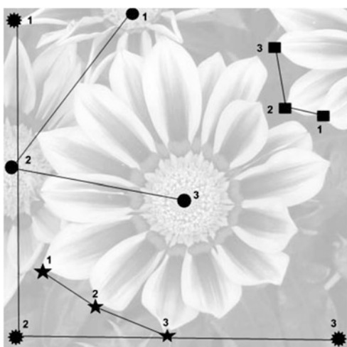
Fig. 4 Samples of click secrets. Different shapes represent different users

For the draw-based, 22 participants agreed that they could remember their secrets well, despite some of them suggested that they should be allowed to draw