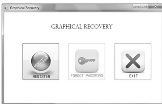
Fig. 1 The screenshot of the prototype's main menu