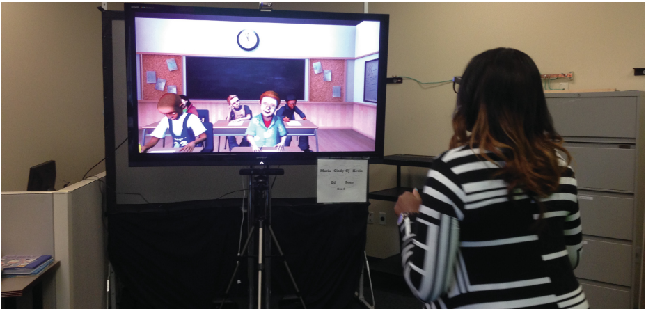
Fig. 1. TeachLivE middle school classroom

Consider the situation of walking into a classroom setting where the students are virtual and yet exhibit personalities that are appropriate for members of their age group (Dieker et al., 2014). This is what a TeachLivE experience provides, currently supporting classes of middle (Fig. 1) and high school students, with elementary students coming in fall 2015.