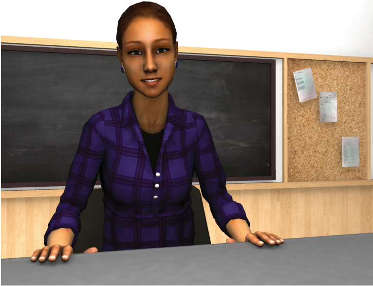
Fig. 6. Prospective teacher candidate