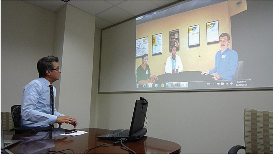
Fig. 7. Debriefing members of a clinical team

the strengths that the physician brings to the team. Figure 7 shows a sample scene from such an interactive session. As with interviews, movement of the virtual camera is not considered necessary, in fact, it is probably detrimental for the effectiveness of this type of experience. This movement is not just distracting but can be perceived to break the concept of place illusion since the point of view must be held fairly static when a human subject is seated (and not moving) in the scene.