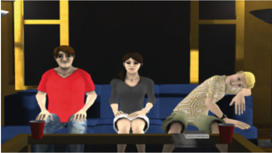
Fig. 5. CollegeLivE scene

ways that are counter to their best interests. This can involve sexual advances or even pushing someone to drink heavily who chooses not to do so.