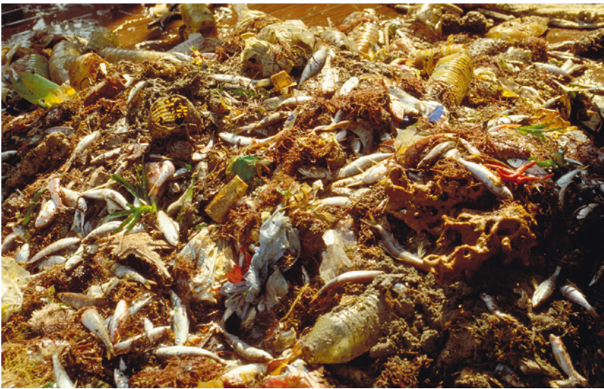
Fig. 2.1 Litter collected by trawling in the Mediterranean Sea, France. 10 min experiment