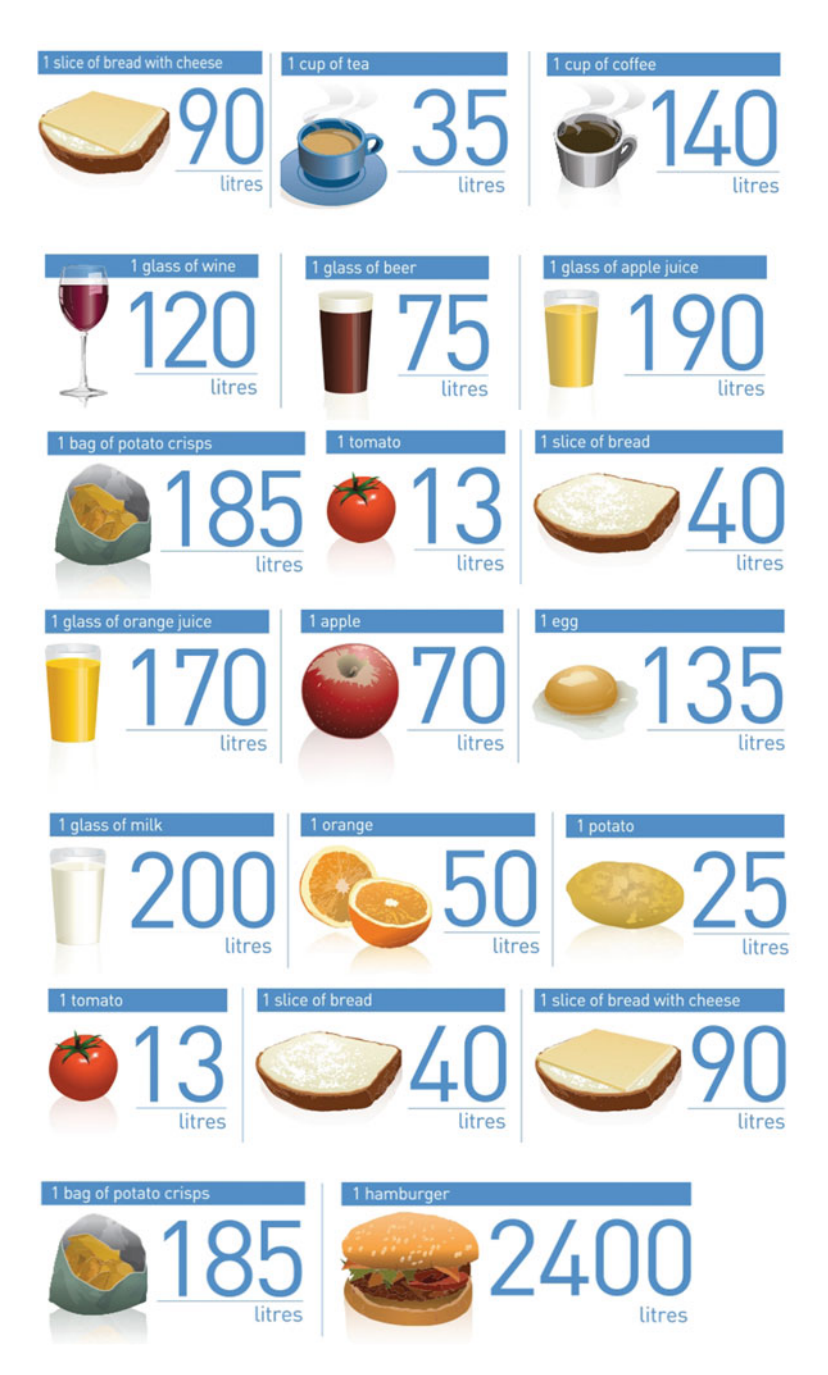
Fig. 1 Virtual water in the more common foods.