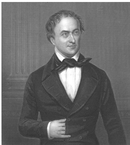
Fig. 2.20 Portrait of Heinrich Rose (1795–1864)

Heinrich ROSE (born 6 August 1795, Berlin; died 27 January 1864, Berlin) was born into a family of scientists, his father and grandfather, both named Valentin Rose, were pharmacists who wrote on pharmaceutical and chemical topics [162, 163] (see Fig. 2.20 for his portrait). Rose first trained as a pharmacist in Danzig (now Gdańsk/Poland) but war against Napoleon intervened. He was in Paris with the occupying army in 1815, whilst there he met the leading French scientists including Berthollet. On his return to Berlin, he worked with Klaproth, long associated with the Rose family. He continued with his pharmaceutical apprenticeship in Mitau (now Jelgava/Latvia), near Riga. In 1819, he travelled via St. Petersburg and Finland to Stockholm to work with Berzelius on mica and then on the properties of titanium. Rose left Stockholm in 1821 and went to Kiel [24XII] and submitted his doctoral thesis on compounds of titanium and then returned to Berlin. In 1822, he became