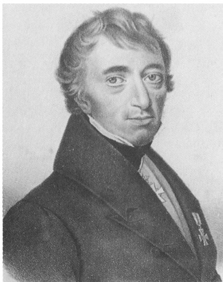
Fig. 2.16 Portrait of Christoph Heinrich Pfaff (1773–1852)

Christoph Heinrich PFAFF (born 2 March 1773, Stuttgart; died 23 April 1852, Kiel) came from a well off family his father being the General Treasurer of Württemberg [24i, 145] (see Fig. 2.16 for his portrait). He was tutored at