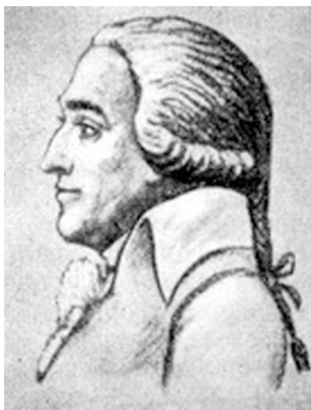
Fig. 2.13 Portrait of Johann Tobias Lowitz (1757–1804) drawn in St. Petersburg in 1799