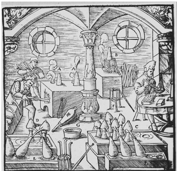
Fig. 2.2 Agricola's illustration of the acid parting of gold and silver [16]. A—Ampullae arranged in the vessels. B—An ampulla standing upright between iron rods. C—Ampullae placed in the sand which is contained in a box, the sprouts of which reach from the opercula into ampullae placed under them. D—Ampullae likewise placed in sand which is contained in a box, of which the sprout from the opercula extends crosswise into ampullae placed under them. E—Other ampullae receiving the distilled aqua and likewise arranged in sand contained in the lower boxes. F—Iron tripod, in which the ampulla is usually placed when there are not many particles of gold to be parted from the silver. G—Vessel

and Latin authors referring to mining. He resigned in 1530 and spent the next 2–3 years in study and travel. About 1533, he became town physician of Chemnitz in Saxony, where he remained until his death in 1555.