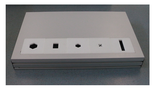
(a) PPT platform used in RoboCup@Work