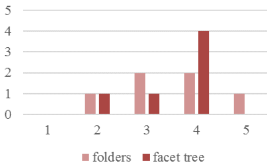
Fig. 4. Satisfaction with the resulting structure

We also enquired about the satisfaction with the resulting structure (see Fig. 4). On the scale 1 to 5, the four was the most frequent with the facet tree. Folders were rated variously, but on average worse. As a main disadvantage of folders was perceived the possibility of assigning the resource only to a single folder in the hierarchy.