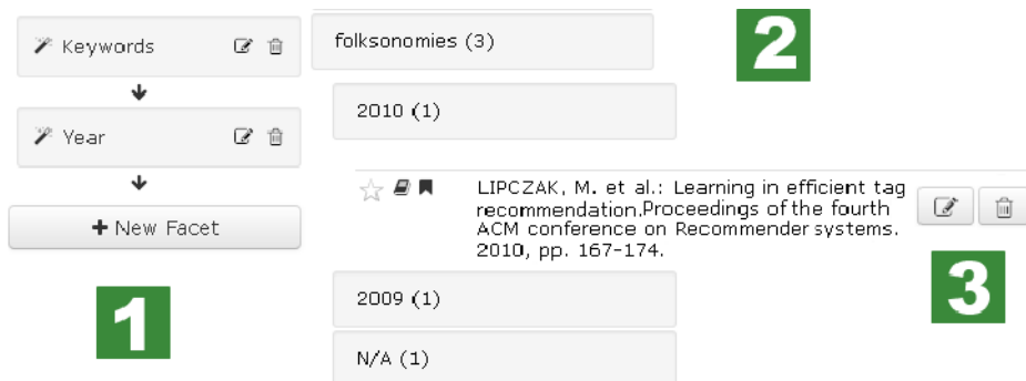
Fig. 1. Example of a facet tree hierarchy, with Keywords and Year facets selected (1). Folder with keyword folksonomies (2) is expanded showing three subfolders containing also NA value. User can edit the resource and its metadata or remove it from the collection (3).

Facet tree allows the users to define hierarchies of the selected facets, thus automatically organizing their collection of documents. An example of such a hierarchy can be seen in Fig. 1; the user selected Keywords facet representing the keywords added to the documents by their authors at the first (root) level and Year facet representing the publication year at the second level.