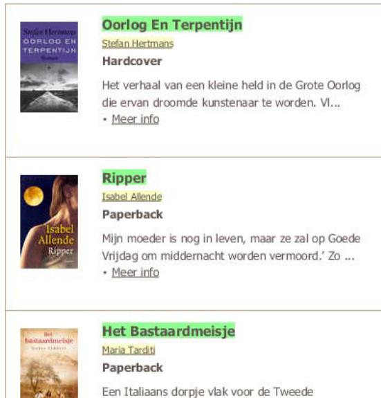
Fig. 1. Example data from http://www.eci.be/boeken/roman-literatuur/literatuur . Key attributes (titles) are marked in green, relative attributes (authors) in yellow.

First, we extract a data set of books from http://www.eci.be/boeken/roman-literatuur/literatuur using an XPath based data extraction tool. For this, we identify the attributes of interest, in our case title and author, and configure one XPath per attribute. For the key attribute, the title, we specify one absolute XPath which evaluates all book titles on the document. For the relative attribute, the author, we specify one relative XPath, which tells the wrapper where the author can be found, given the title. Our goal is to reconstruct these XPaths using our approach. First, we investigate how we can reconstruct the XPath for the key attribute, the title. Then, we look at how we can calculate the XPath for the relative attribute, the author.