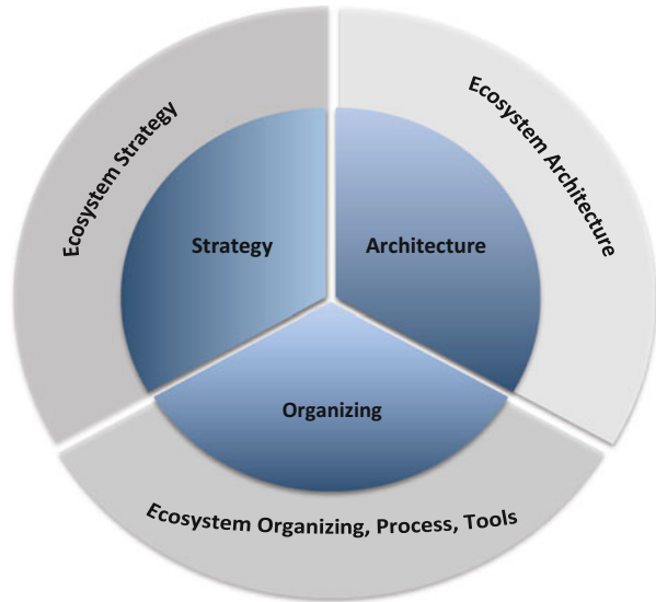
Fig. 2.2 The ESAO model [6]