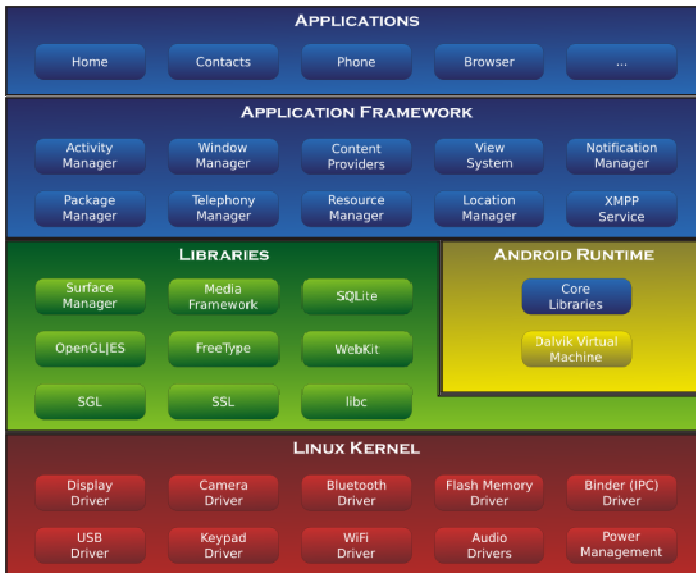
Fig. 1. Android system architecture overview

With the use of Android Application Framework, all developers can have access to the core services. The architecture allows for the easy reuse of components, and, most notably, every application can publish what type of action it can perform. This allows for loosely binding the components together without knowing the exact nature of them. Also, with the use of broadcast receivers, the application can receive and respond the system-wide broadcasts (an example can be the incoming phone call or message) or can respond to specific broadcasts (as a form of communicating between components of the application).