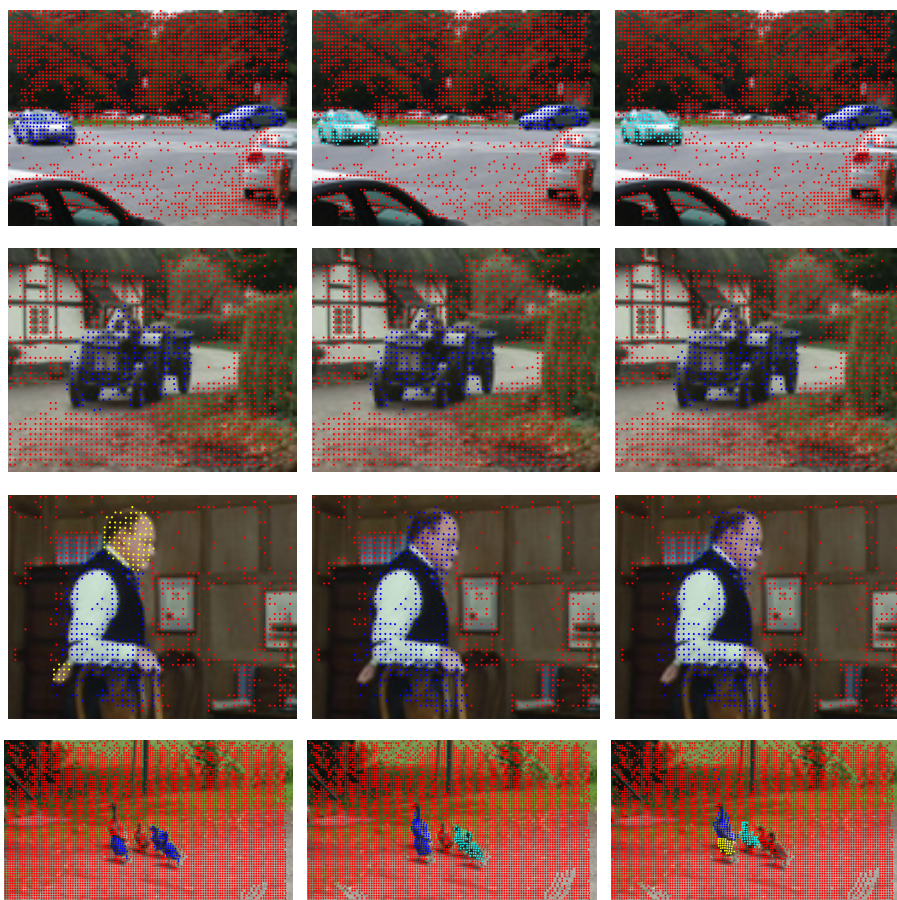
(a) Brox and Malik [26]. (b) Ochs and Brox [7]. (c) Our method.