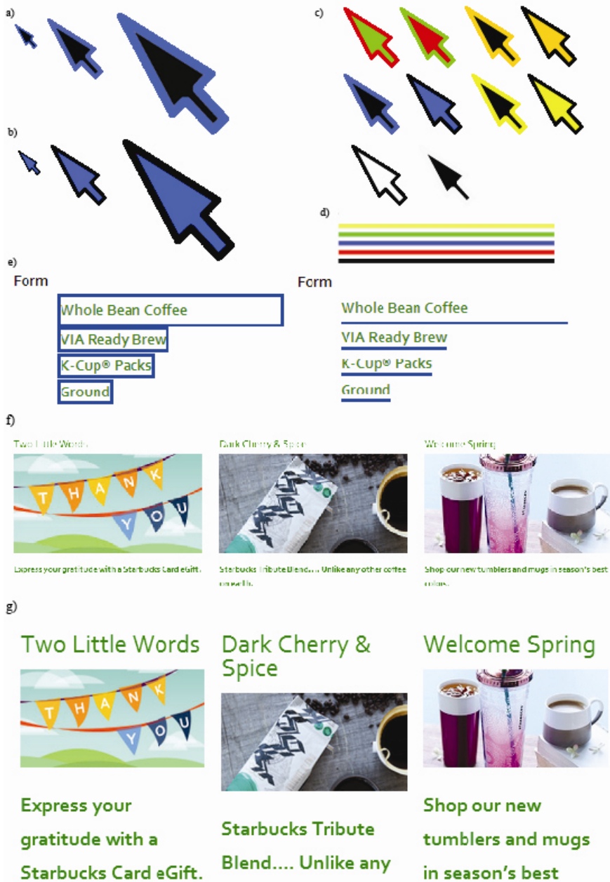
Fig. 1. Some of the features present during the first user experiment. a) Mouse cursor sizes; b) Mouse cursor over links; c) Available cursor colours; d) Link enhancement colours; e) Link enhanced with box/underline; f) Webpage with high zoom and low font size; g) Page with low zoom and high font size.