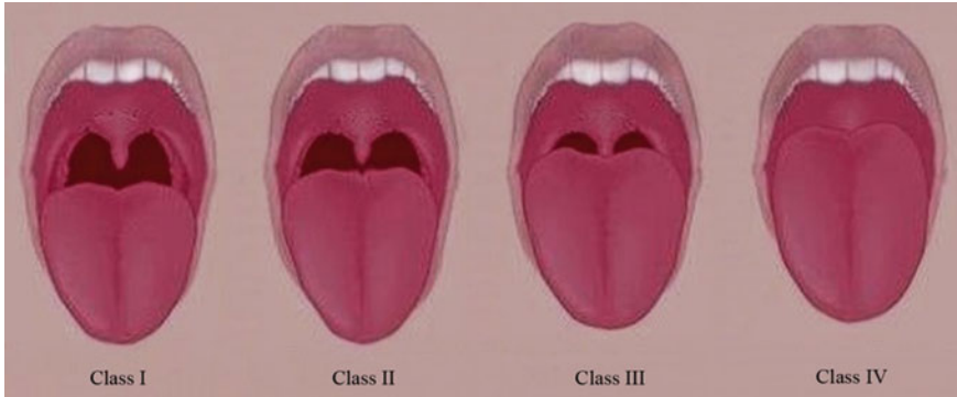
Fig. 2.1 Schematic classification of the pharyngeal structures based on Samssoon and Young's modification of the original Mallampati classification