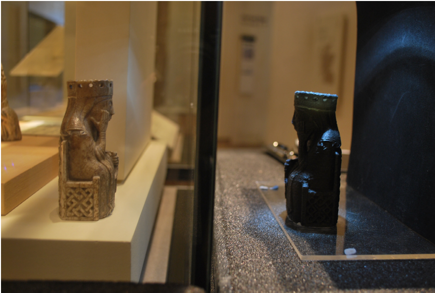
Fig. 1. The Lewis Chess piece behind the glass and the mirrored 3-D printed replica

The replica was created by laser scanning the original artefact, mirroring it to the original (i.e. lateral inversion of the scan data before printing) so that the user's experience would match the object in the case. The need to present mirror images as part of virtual reality and co-location interfaces is part of virtual reality issues [3] [18]. The replica was then painted black so that it would absorb light thereby reducing its reflection in the glass case. The replica is placed facing the chess piece at an equal distance from the display glass (Fig.1). When a user places her hands on the replica and concentrates her gaze at the original piece behind the glass, she can see her hands reflected in the glass apparently touching the real artefact in the display case (Fig.2). Because she sees the actual artefact (and her hands) and touches the replica she experiences the sensation that she is actually touching the artefact itself. The illusion is further strengthened by placing a cover over the replica to shield it from the user's direct gaze. This cover also contains a light to illuminate the user's hands so that their reflection is brighter.