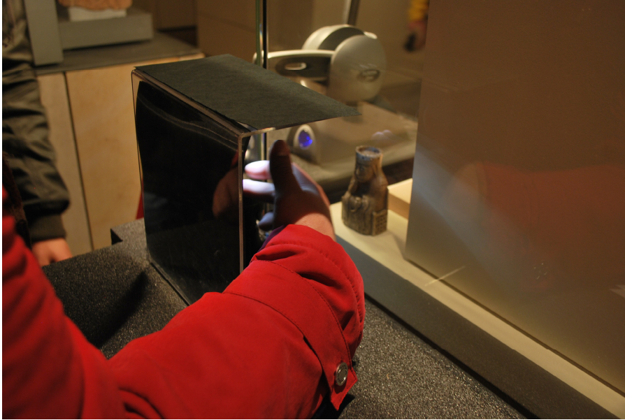
Fig. 2. Visitor interaction with the replica. Her gaze is concentrated at the original artefact behind the glass

This is a novel way of using a haptic device for immersing museum visitors into a deep understanding of the museum exhibits. In [19] museum visitors explore the surface of a digital daguerreotype case from the collection of the Natural History Museum of Los Angeles County. Similarly, the Haptic Museum, developed in the University of Southern California, is a haptic interface that allows museum visitors to examine virtual museum artefacts with a haptic device [21]. The 'Museum of Pure Form' is a virtual reality system that allows the user to interact with virtual models of 3-D art forms and sculptures using haptic devices and small-scale haptic exoskeletons [1,2]. The Senses in Touch II, which was installed in the Hunterian Museum in Glasgow, was designed to allow blind and partially-sighted museum visitors, particularly children, to feel virtual objects in the collection via a PC and Wingman haptic mouse [13]. The projects described above have used detailed virtual models of the museum artefacts and allowed the visitor to explore them with the haptic technology. Our goal was to diverge from the computer screen, and use the haptic technology in a way that evokes direct haptic interaction with the physical artefact without actually touching it providing the illusion of doing so.