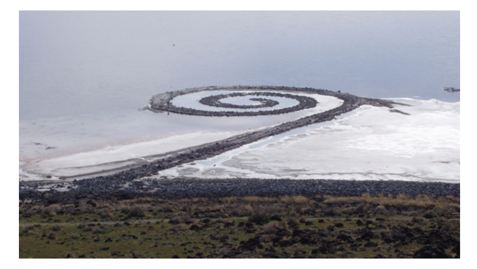
Fig. 8.3 Spiral Jetty by Robert Smithson (1970). 1,500 ft in Utah, US