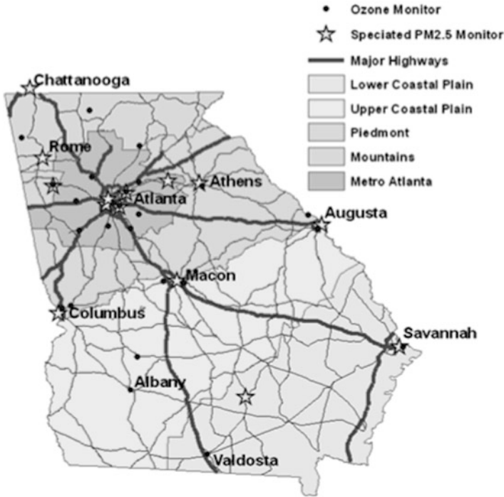
Fig. 49.1 Map of Georgia showing regions and major cities, major roadways, and locations of speciated PM 2.5 and ozone monitors

of these methods involves rescaling the CMAQ data ( C_2^* , Eq. 49.3). The other two methods involve kriging error on a multiplicative ( C_3^* , Eq. 49.4) and additive ( C_4^* , Eq. 49.5) basis. Data withholding was used to evaluate model performance. Two of the methods were then selected and combined to provide results that minimized bias and maximized correlation over time and space with withheld data.