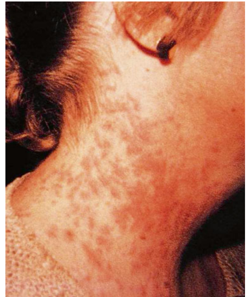
Cholinergic urticaria