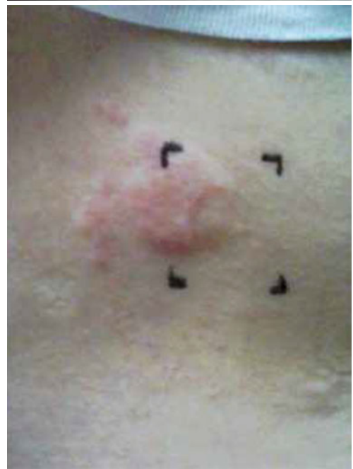
Delayed pressure urticarial