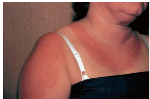
Solar urticaria