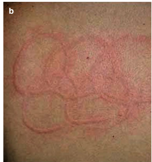
Urticaria – dermatographism