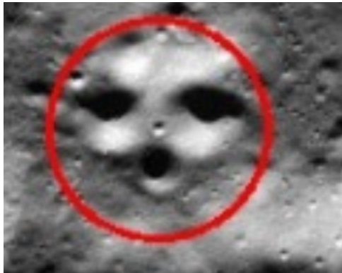
Fig. 4. “Grey Aliens” on the Moon

We explored face-like structures from 11,829,761,106 pixels, including 10,059,979,678 pixels on the Mars surface, and 533,491,975 pixels on the Moon surface, and 1,236,289,453 pixels of others, provided by NASA Space App Challenge.