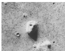
Fig. 1. Face on Mars

"Face-like" structures have been found in many provinces on the earth or other stars [5][2]. They are rocks or other geographical structures that look like a human face.