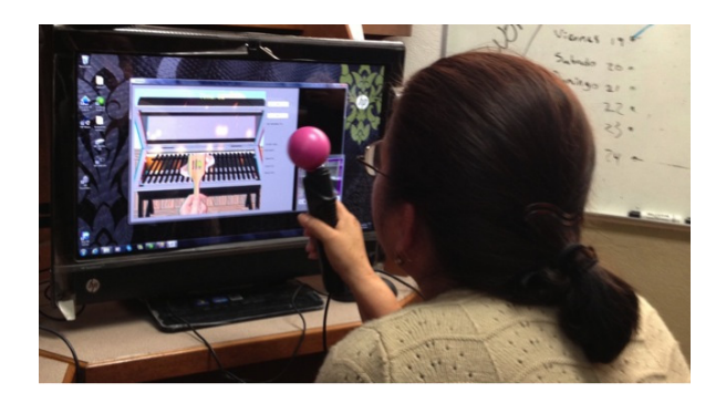
Fig. 1. The Gesture therapy virtual rehabilitation platform for the upper limb. Gesture Therapy characteristic gripper permits controlling of the user avatar through tracking of the colorful ball as well as monitoring gripping forces by an incorporated pressure sensor. Serious games of the platform as the one pictured encourage repetitive exercises beneficial for motor rehabilitation.

Virtual Rehabilitation. Brain injury resulting from stroke or palsy often leaves patients with motor impairment. Several rehabilitation therapies are available for motor restoration [1]. Among them, virtual reality based therapies have recently become a valid alternative, an option that is now known as virtual rehabilitation [2]. Virtual rehabilitation commonly involves concealing rehabilitation exercises as serious games. By now, a few tens of virtual rehabilitation platforms have been developed [3]. For the experiments presented in this work we rely on Gesture Therapy (GT) [3, 4], a low cost virtual rehabilitation platform for the upper limb illustrated in Figure 1. GT has demonstrated clinical value similar to occupational therapy in two different trials but with an edge on motivation [4, 5].