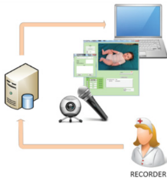
Fig. 2: Acquisition Tool.

The acquisition system (fig. 2) is designed to be used also from patient's home to minimize the discomfort for the involved subjects, and to minimize biases due to external environment on children habits. The system was tested with different webcams or cameras with USB and different microphones. The ARAD system allows the user to enter most of the data from medical records. Automatic importing from already existing medical records is possible but it depends on the system used in the hospital. In any case, the user can enter the required historical data for this type of analysis.