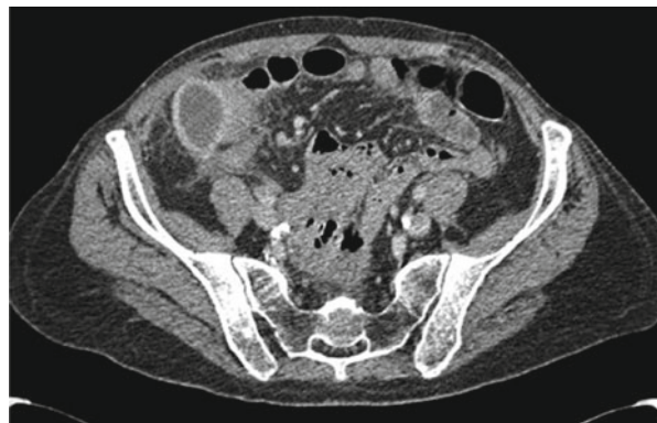
Fig. 56.3 CT scan, new abscess, 3 weeks after 1st operation

leukocytosis of 12.5 \times 10^9/l . On the CT scan an abscess was found paracolic space right, again being drained (Fig. 56.3) and treated by iv broad spectrum antibiotics (AB). Nutrition and general condition improved, and after retiring the drain, she could return home at the 10th day following readmission.