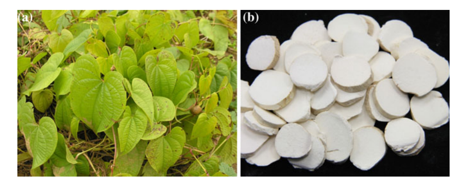
Fig. 12.1 Areal part of Chinese yam ( Dioscorea opposite ) with bulbils in leaf axil (a) and sliced dry roots as crude drug (b)

the most popular and widely cultivated yams in Taiwan due to its superior characteristics such as high nutritional values, resistance against anthracnose, high and stable productivity, and wide adaptability [6].