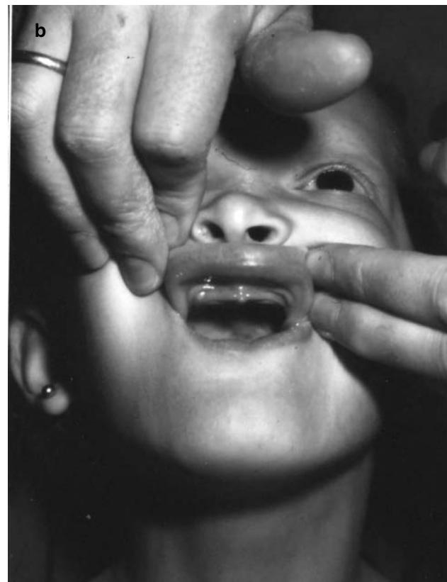
Fig. 3. Same patient as in Figs. 1 and 2. (a) Periorbital pigmentation and presence only of canines in the lower arcade; (b) Anodontia in the upper arcade.

and nasal mucosa most often appear dry and atrophic. Dental roentgenograms show the hypodontia or anodontia and the conical form of tooth crowns (Fig. 4).