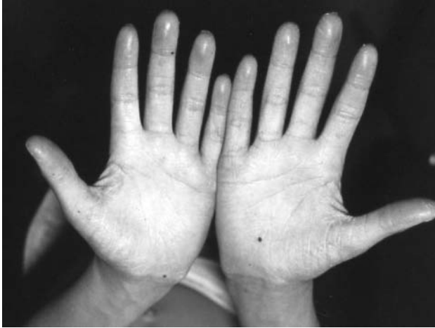
Fig. 2. The palms of the same patient as in Fig. 1 shows dry skin.

may be mistaken for a colloidon membrane. Periorbital hyperpigmentation around the eyes is a characteristic features of the disorder. Small milia-like papules may be found on the face.