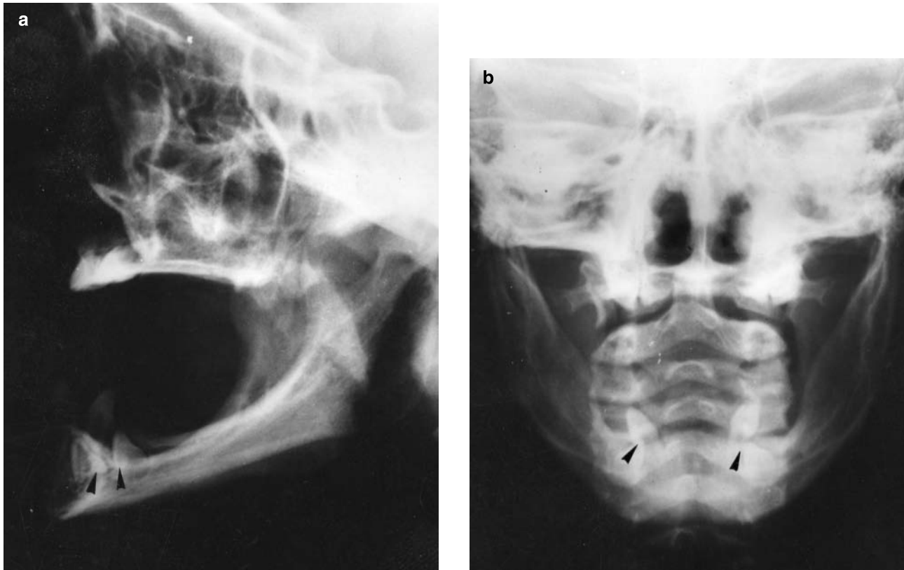
Fig. 4. Dental roentgenograms of the same patient. Sagittal and coronal views confirm the presence of two canines in the mandible (arrow heads) and anodontia of the other teeth.