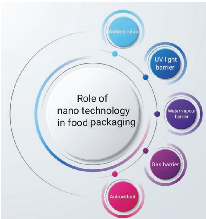
Fig. 4.1 Nanotechnology role in food packaging

Most of the NPs used in food packaging have potential antibacterial action and prevent microbial spoilage. Through the controlled release of antimicrobials from the packed substance, packaging material composed of a coating of starch colloids containing the antimicrobial agent works as a barrier against microorganisms. NPs are employed as incorporate enzymes, antioxidants,, flavors and anti-browning agents carrier and other bioactive substances to extend the storage time of opened packages (Nile et al., 2020) (Fig. 4.1).