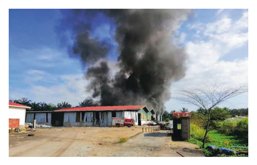
Fig. 2 Plastic waste facility on fire – Sungai Rambai, Jenjarom, Selangor, January 12, 2019.

contained electronic wastes, tests conducted by Greenpeace on samples of similar shredded material from a dumpsite in Seri Cheeding, Kuala Langat, Selangor, revealed relatively high concentrations of metals and metalloids such as copper, lead, zinc, and cadmium, as well as other persistent organic compounds such as brominated flame retardants and phthalates or plasticizers, which could impact the health of flora and fauna negatively or cause secondary pollution to nearby water sources (Greenpeace Malaysia, 2020, p. 12).<sup>28</sup>