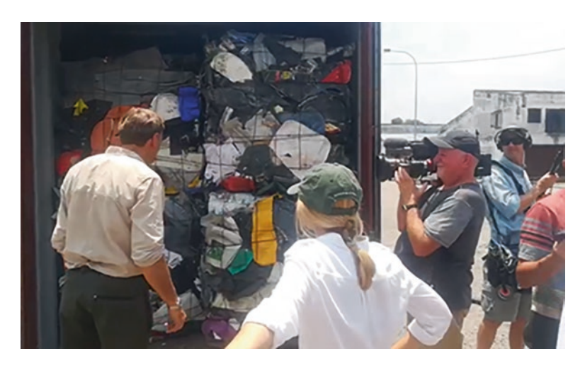
Fig. 5 Australian journalists intercepting a mixed waste container – Pulau Indah, Selangor, March 15, 2019.

2018.<sup>54</sup> From January 1 to September 20, 2020, a total of 17,445 inspections on various premises had been conducted under the EQA.<sup>55</sup> These enforcement efforts are time-consuming and labor-intensive. Joint enforcement operations were organized across various states, involving federal agencies, state governments, and local authorities, along with much coordination among multiple agencies.