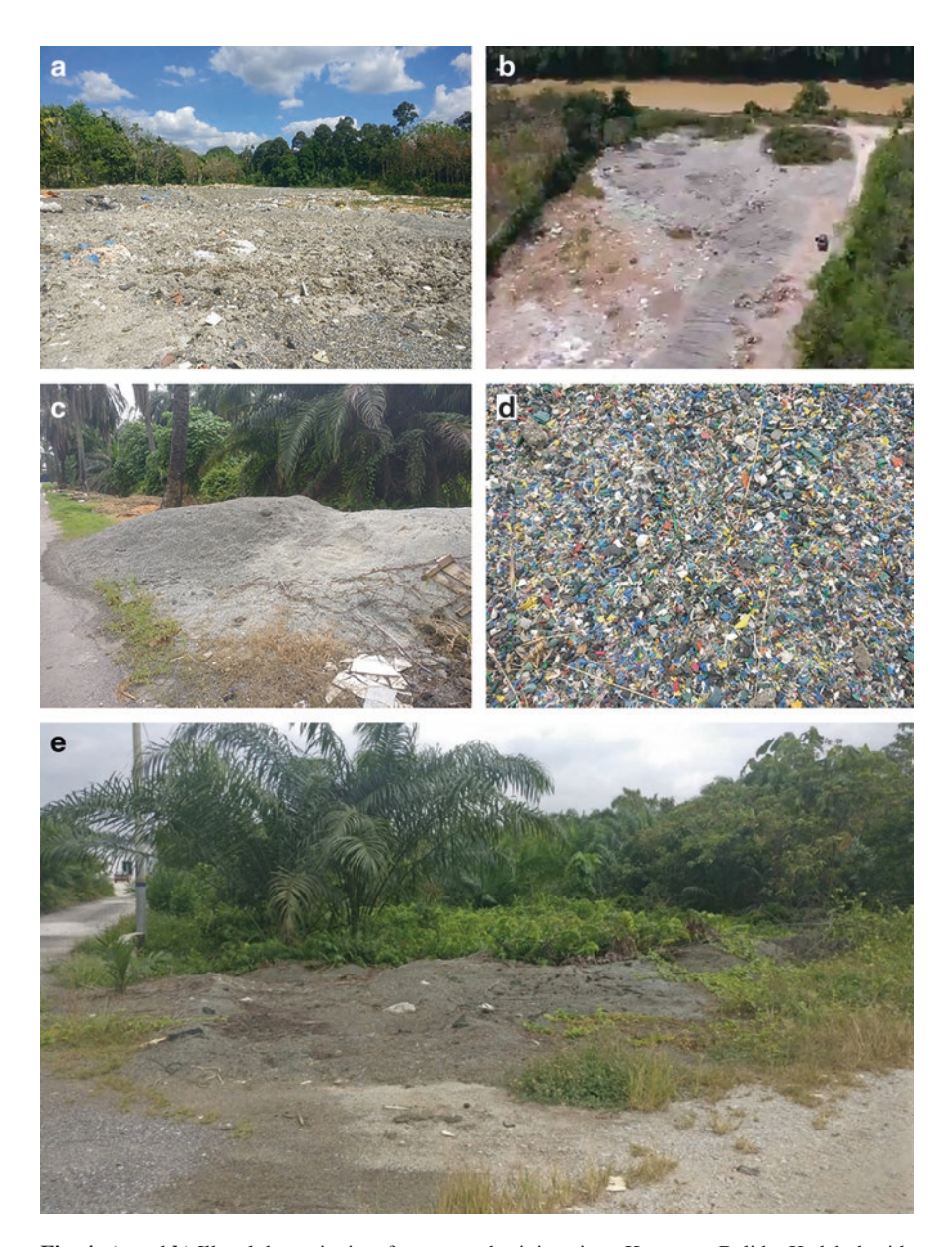
Fig. 4 (a and b) Illegal dumpsite in a former sand-mining site – Kampung Belida, Kedah, beside the Muda River, January 31, 2020. (c and d) Illegally dumped shredded waste – Telok Panglima Garang, Selangor, January 12, 2020 and Seri Cheeding, Selangor, September 5, 2020. (e) "Cleared" illegal dumpsite still emitting toxic fumes under the sun – Kampung Seri Cheeding, Banting, Selangor, September 5, 2020.