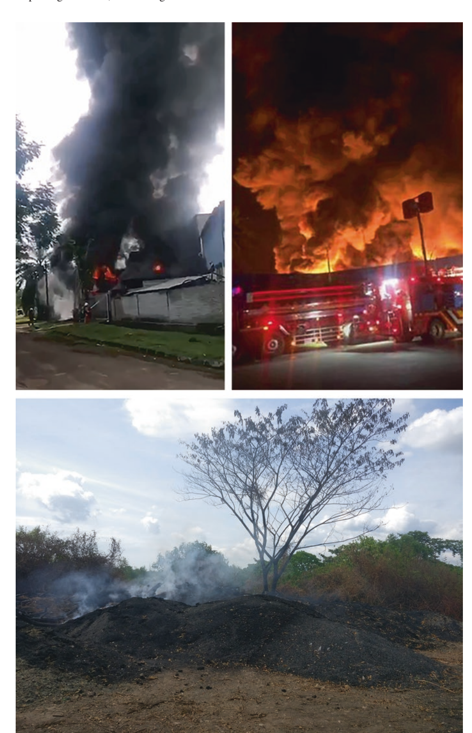
Fig. 3 Upper left: plastic waste facility on fire – Telok Panglima Garang, Selangor, October 17, 2019. Upper right: plastic waste facility on fire – Sungai Petani, Kedah, November 21, 2020. Lower: shredded waste dumped and set on fire – Sungai Petani, Kedah, January 31, 2020.