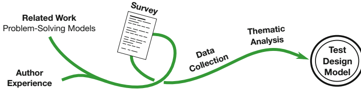
Fig. 1. Overview of the method used for collecting data and developing the problem-solving model of test design.

Letovsky [12] delved into the cognitive processes behind program comprehension, with a focus on specific moments that occur within seconds or minutes, such as understanding the purpose behind a line of code. This investigation led to the creation of a categorization system for questions and hypotheses, along with a theory of the mental images and processes that produced them. The questions were defined as procedures that evaluate the coherence and accuracy of a person’s developing mental model, while the hypotheses were identified as a planning process that draws on various forms of knowledge.