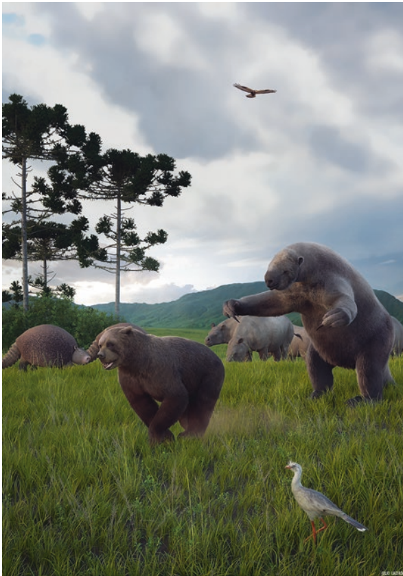
Fig. 3.4 Late Pleistocene landscape of Rio Grande do Sul, showing from left to right the glyptodont Glyptodon clavipes , the ursid Arctotherium , the toxodontid Toxodon platensis (behind), and the megatheriid Megatherium americanum . The predominance of herbaceous vegetation is also evident, typical of parts of the landscape with a less significant presence of Araucaria Forest. (Artwork Julio Lacerda)

Concerning autochthonous South American mammals present in the Pleistocene of RS, a first group is Xenarthra the only placental lineage with extant species originating in South America. This is one of the most emblematic groups of the Cenozoic of this continent because of their great taxonomic diversity, abundant fossil record, and endemism (Gaudin and Croft 2015). During the Pleistocene of RS, xenarthrans were represented by two groups: pilosans (ground sloths) and cingulates (glyptodonts, armadillos, and pampatheres). Both megatheriid and mylodontid ground sloths have been found in RS Pleistocene deposits (Oliveira 1992, 1996). Megatheriid