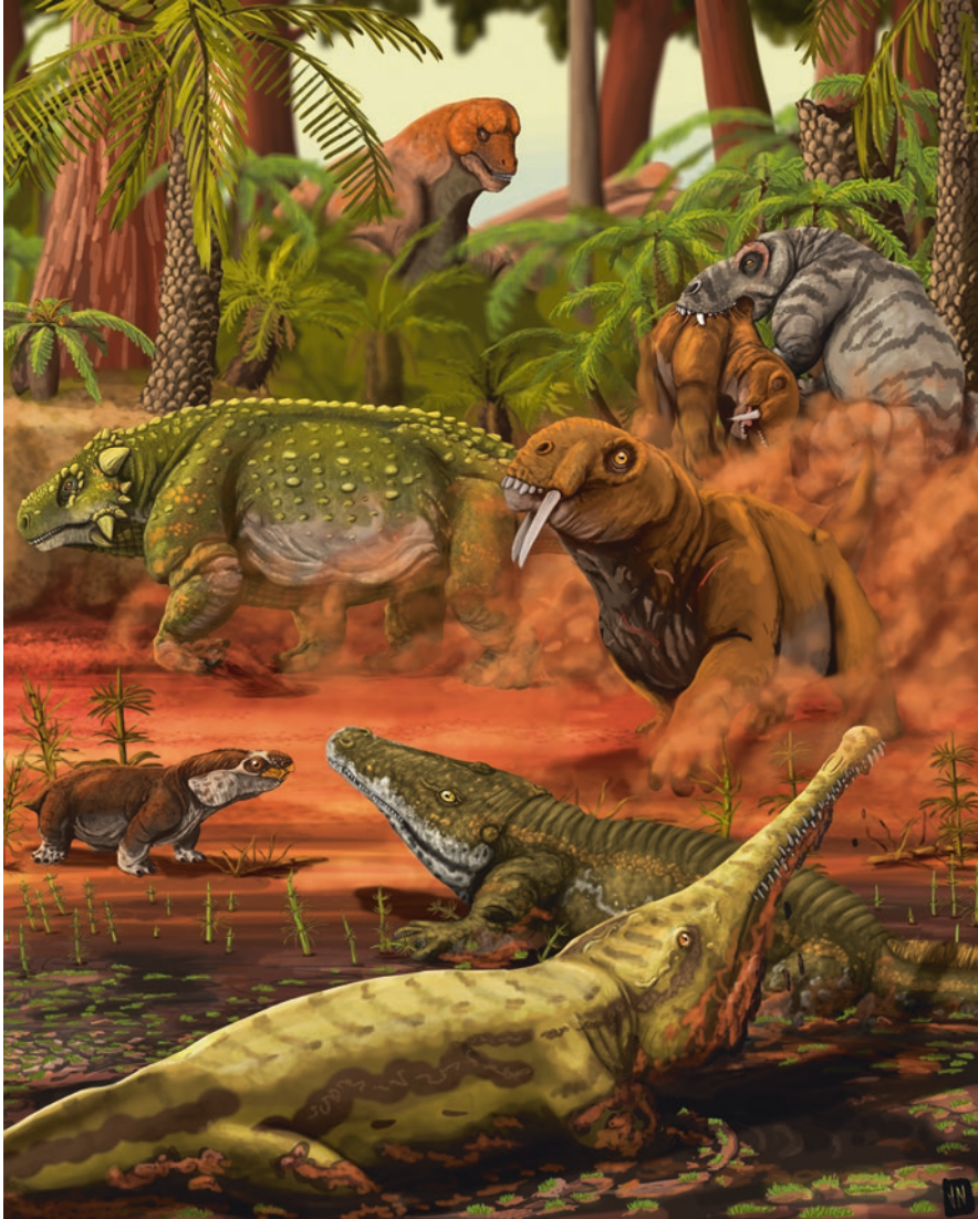
Fig. 3.2 Permian. Faunistic elements depicted, from front to back: Australerpeton, Bageherpeton, Rastodon, Tiarajudens, Provelosaurus, Pampaphoneus, and indeterminate tapinocephalian. (Floristic records: Equisetales and Cycadaceae.)