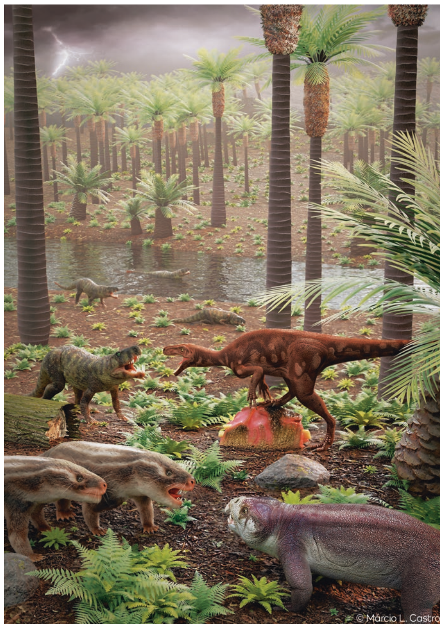
Fig. 3.3 Triassic. Faunistic elements, from front to back: Hyperodapedon, Exaeretodon, Gnathovorax, and Dinamigosuchus. (Floristic records: Dicroidium, Cycadaceae.)