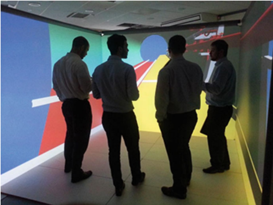
Fig. 10.2 Collaborative visualisation in 3D Move. (Nikolić et al. 2019)

An example of collaborative design visualisation is 3D MOVE (Mobile Visualisation Environment), developed at the University of Reading. It is a collaborative tool for multiple users to interact with and explore full-scale 3D models and built environments (see Fig. 10.2). A study of this technology showed that using collaborative VR environments like 3D MOVE can give project teams more ability to question, evaluate, and justify design decisions (Nikolić et al. 2019), resulting in improved design performance and efficiency and reducing resources needed to build the asset. There are commercial offerings that provide collaborative design visualisation capabilities for the construction industry. For example, Mission Room and Fulcro Fullmax are two companies that offer semi-immersive hardware solutions for construction projects. They use software solutions such as Revit360, Unity Reflect, BIM 360, and Fuzor for their software workflows.