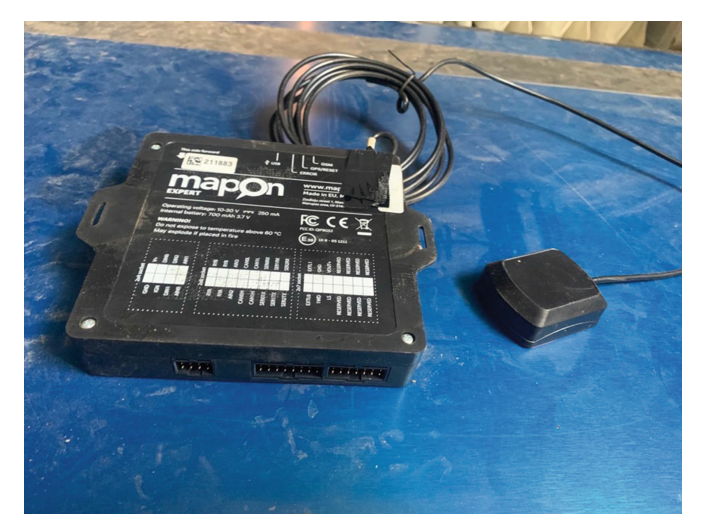
Fig. 1. GPS device - which is installed in the truck.