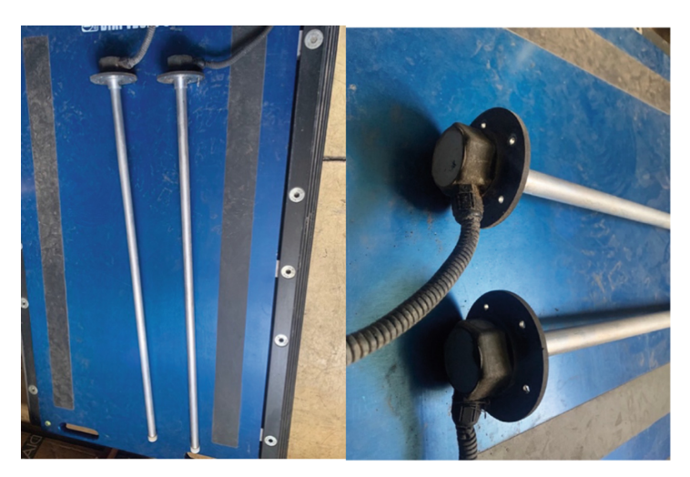
Fig. 2. Fuel level measurement sensor.

Figure 2, given below, shows the device with which the forwarder can determine the fuel level in the tanks.