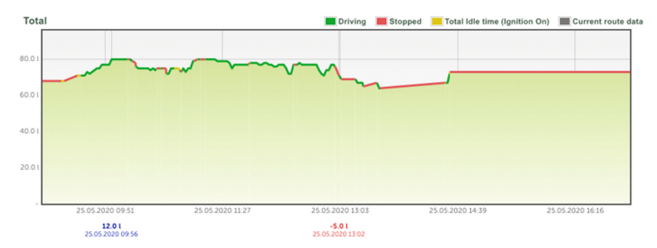
Fig. 3. Fuel level monitoring.

wind. When driving against the wind, the truck consumes more fuel than when driving into the wind.