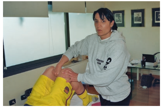
Fig. 42.4 In the squeeze test 4, the operator asks the patient to perform an isometric adduction with the resistance placed at the level of the patient's ankles keeping his/her legs flexed. This test shows a sensitivity and specificity equal to, respectively, 0.65 and 0.46. Since the likelihood ratio value is equal to 1.2, this test used alone results to be rarely useful